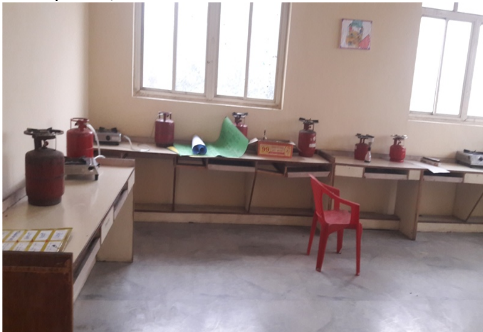
Work experience/Home Science lab