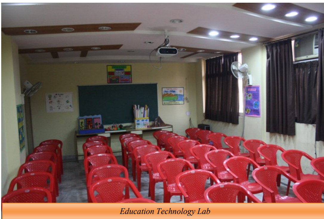
Education Technology Lab