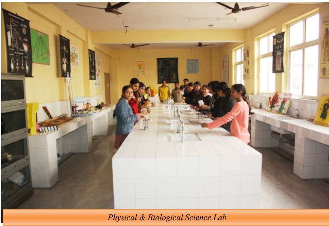
Physical & Biological Science Lab