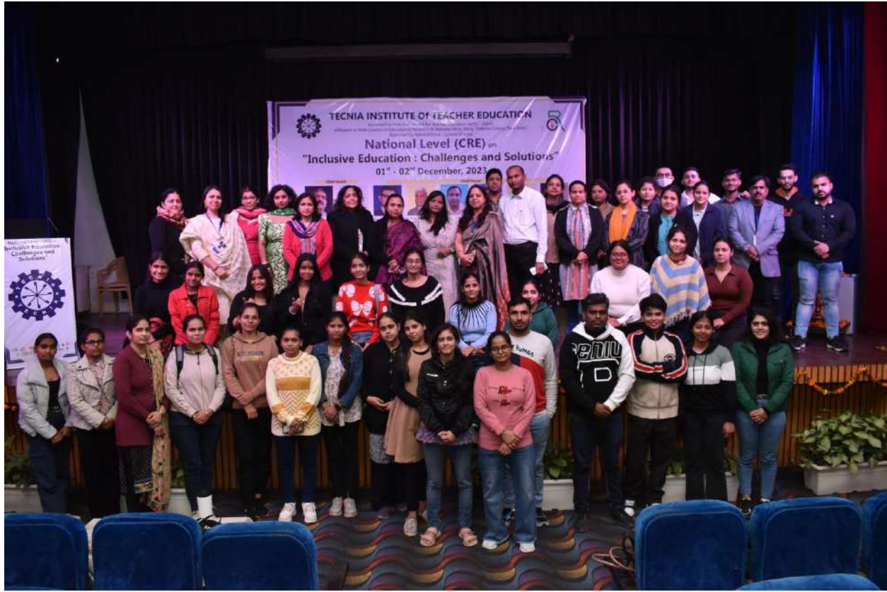
Group Photo at End of Session

TECNIA INSTITUTE OF TEACHER EDUCATION (Recognized by NCTE (N.R.C.), Govt. of India & Affiliated to S.C.E.R.T., Delhi & RCI) F-19, Sector-8, Rohini, Delhi-110085 Tel: 011-27948500; 27948400, Email:-tite.rohini08@gmail.com