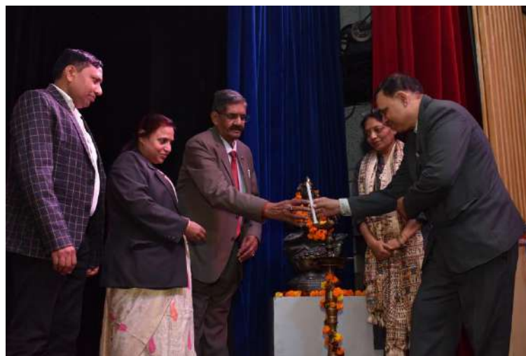
Lamp lighting by Chief Guests