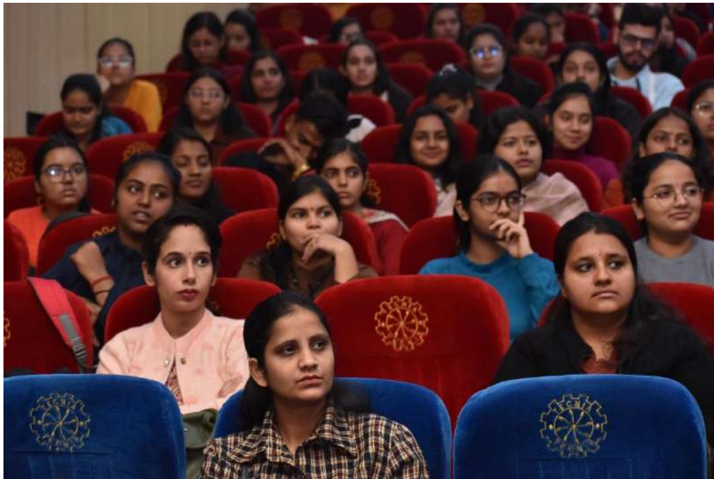
CRE participants listening attentively